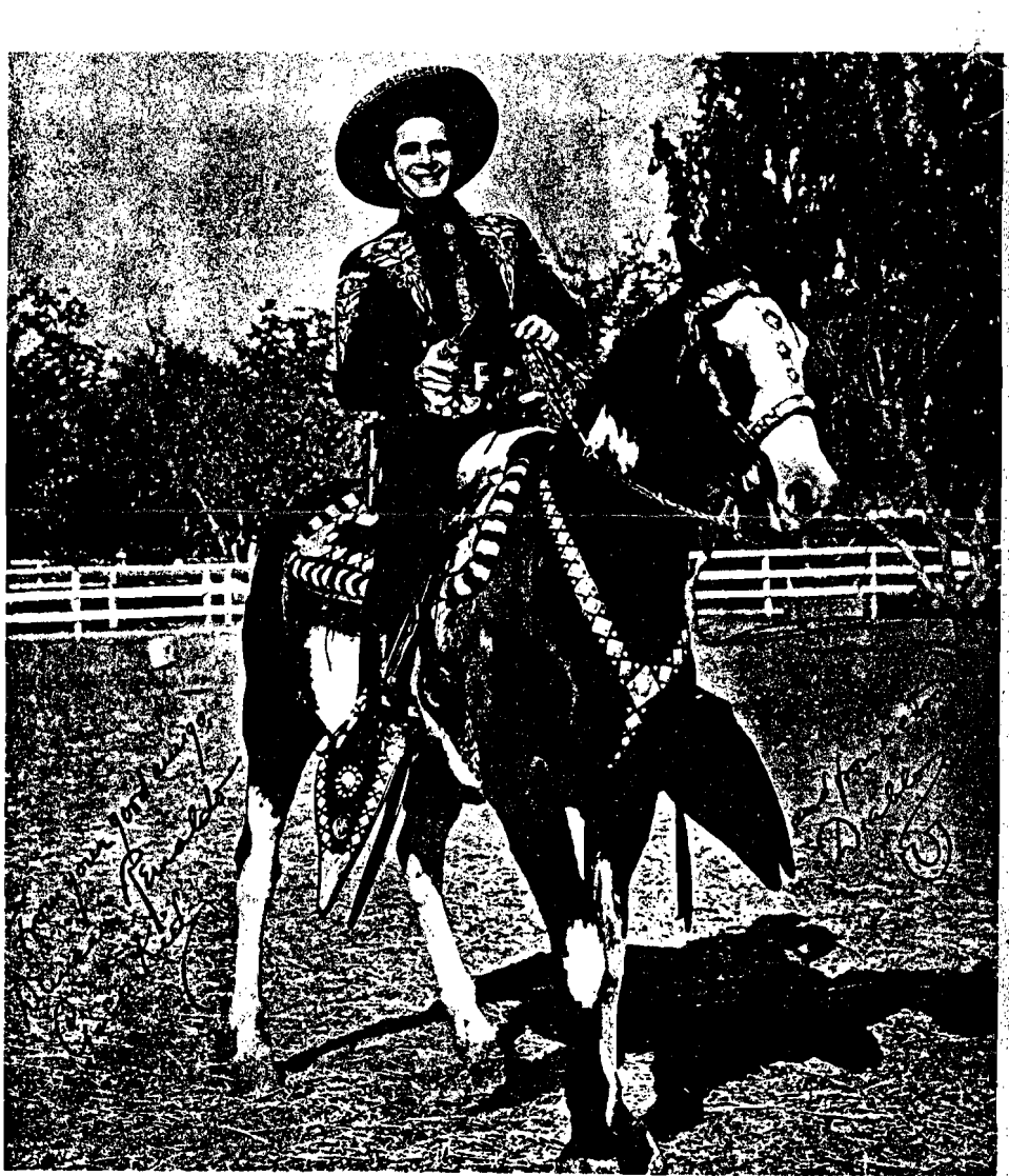
Don't Miss the CISCO KID and PANCHO on-

Station WGN RADIO Tues. & Thur. 7:30 P. M.